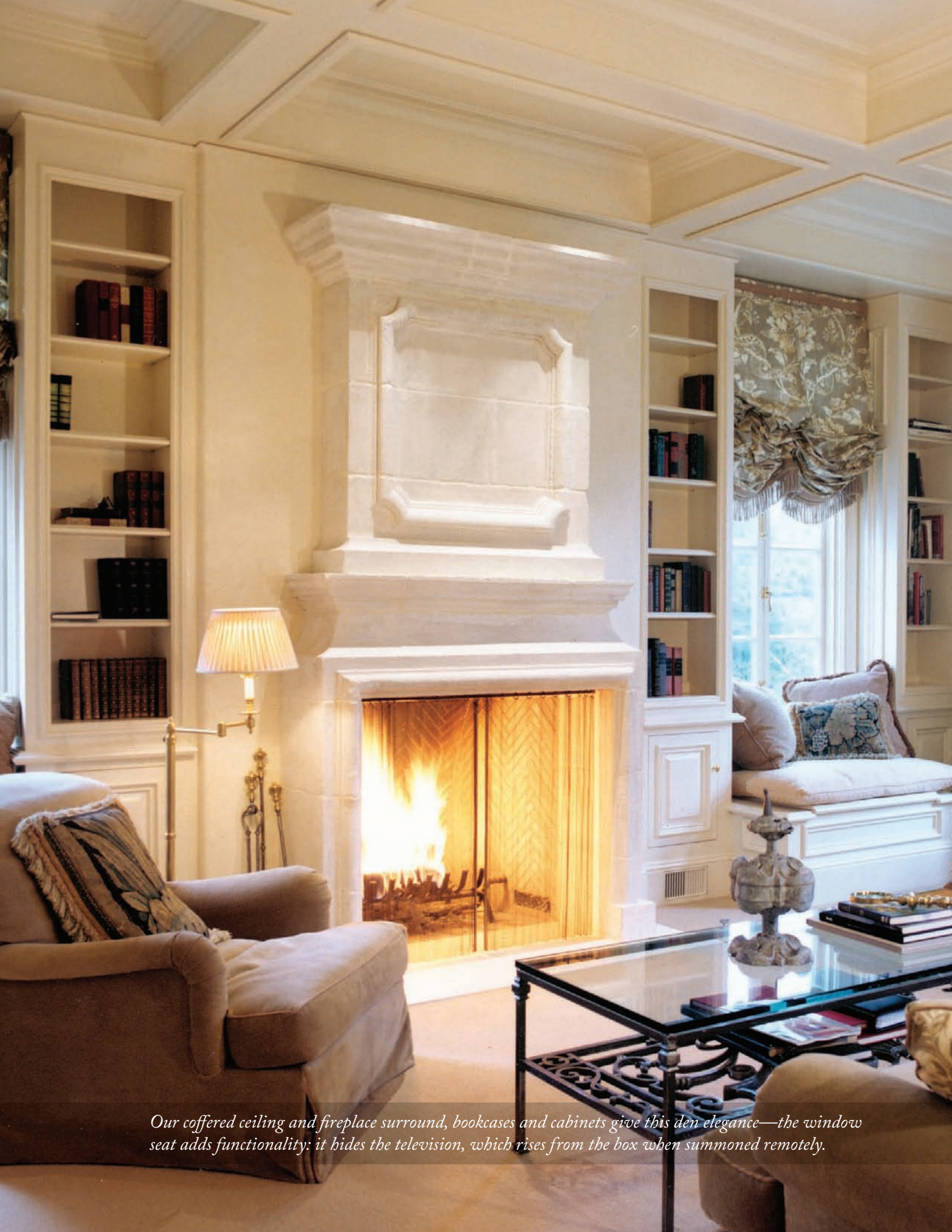
Our coffered ceiling and fireplace surround, bookcases and cabinets give this den elegance—the window seat adds functionality: it hides the television, which rises from the box when summoned remotely.